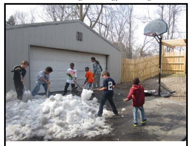
March 31, 2014: We cannot wait any longer to play basketball, even if it means moving this snow pile by hand (with success!)

We have also been active this spring working with Voices for Creative Nonviolence, Kalamazoo Non-Violent Opponents of War, and other groups planning a 163-mile walk from Chicago to Battle Creek in opposition to drone warfare. The walk will begin June 3 and end June 14 at the Battle Creek Air National Guard Base, passing through Kalamazoo Thursday, June 12. For more information on drone war, check out the